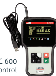
TLC 600 Remote control