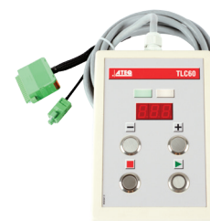
TLC 60 Remote control