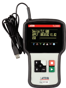
TLC 600 Remote control