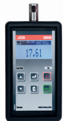
CDF 60 Leak/Flow Calibrator