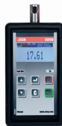
CDF 60 Leak/Flow Calibrator